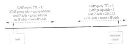
Figure 13.3 IGMP reports and queries.

Wireless & Multimedia Network Laboratory™